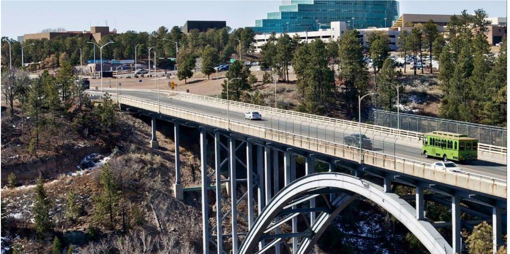
"Omega Bridge"